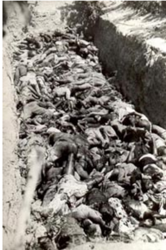
Fig. 1 Mass grave, Cassinga (Pagano)

all-out campaign against the Namibian resistance”. 18 The picture was included in the Kassinga File, a collection of images compiled by Pagano and Swedish filmmaker Sven Asberg. 19 The file was distributed to the network of agencies and organisations affiliated to the international anti-apartheid movement. These organisations distributed and displayed the images of the mass grave at public exhibitions and in publications. The shot became emblematic of the Cassinga massacre.